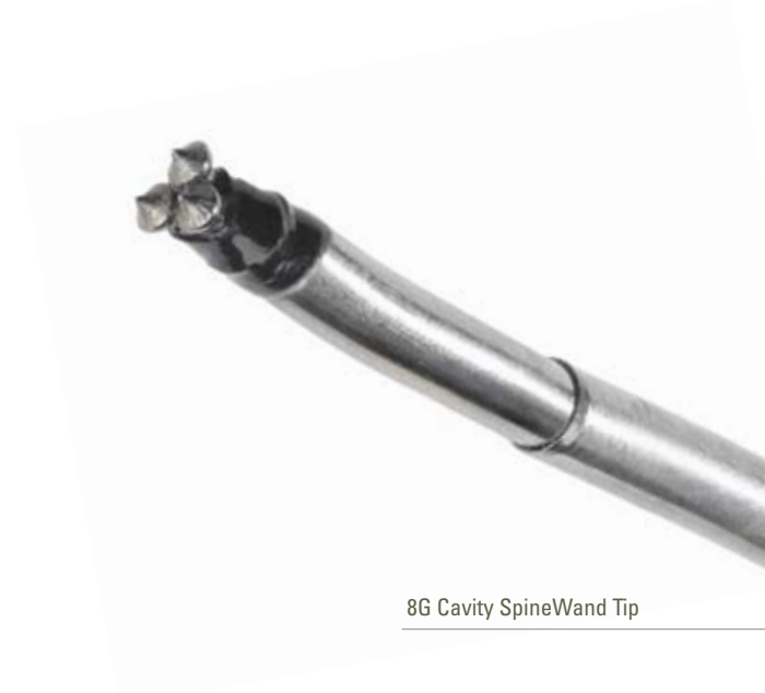
8G Cavity SpineWand Tip