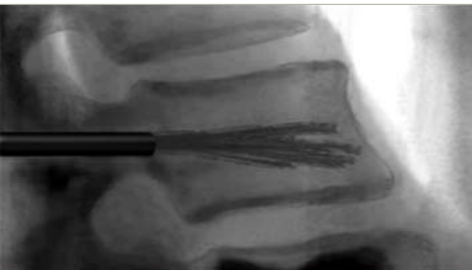
Cement channels in vertebral body, after tumor ablation and Vertebroplasty

Coblation is a proven technology for removing soft tissue. It has been used in millions of procedures worldwide and is available to your cancer patients.